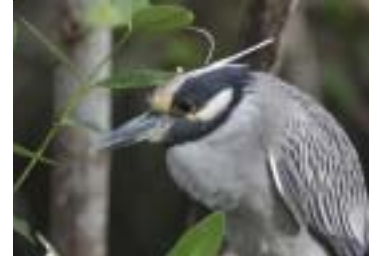
Yellow-crowned Night Heron